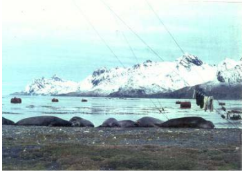
Stromness Bay, South Georgia, 26-12-65

The geology was, firstly, highly folded and faulted volcanic sediments (and raised beaches) on South Georgia, the most northerly island of the Scotia Arc, which formerly linked the South American Andes to the Antarctic Peninsula. Moving onto the Antarctic continent proper, the geology in the Theron Mountains comprised continental, fluvial sediments of Permian age intruded by thick sills of Jurassic dolerite with distinct associations with similar igneous rocks elsewhere in Gondwanaland.