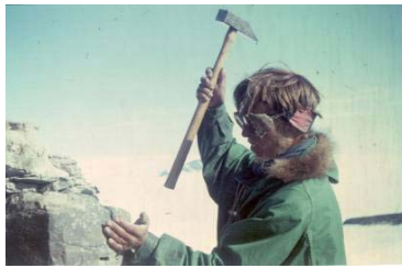
Geologist at work