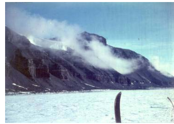
The Theron Mountains

However, most of the time was not spent doing geology and the talk will include the wildlife, a bit of history and an illustration of what it was really like and how things have changed a little since then.